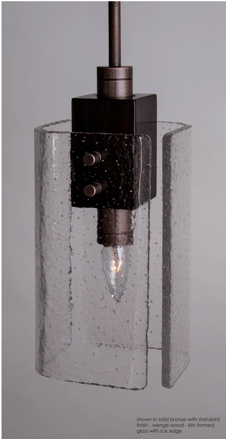
shown in solid bronze with standard finish - wenge wood - kiln formed glass with ice edge